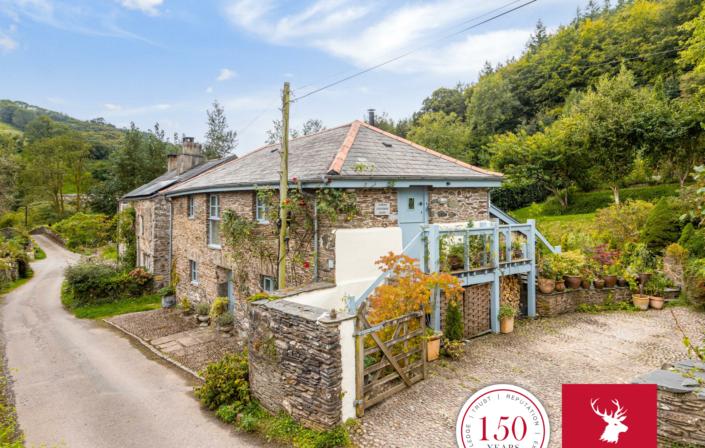
Lower Luscombe Barn