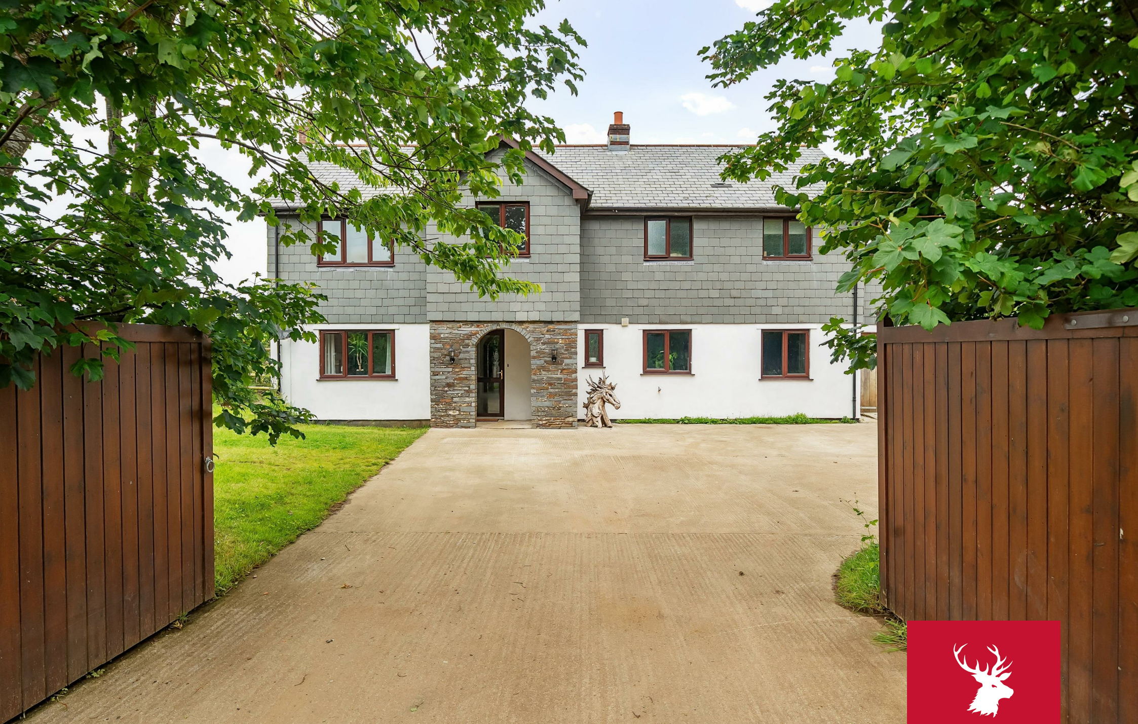
Laskeys Farm House