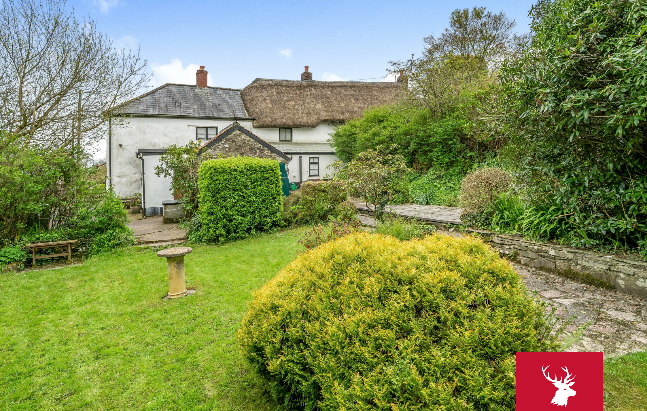
Shoemakers and River Cottage