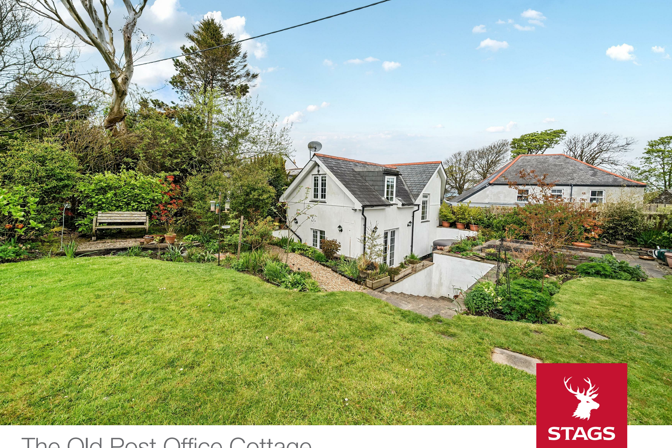
The Old Post Office Cottage