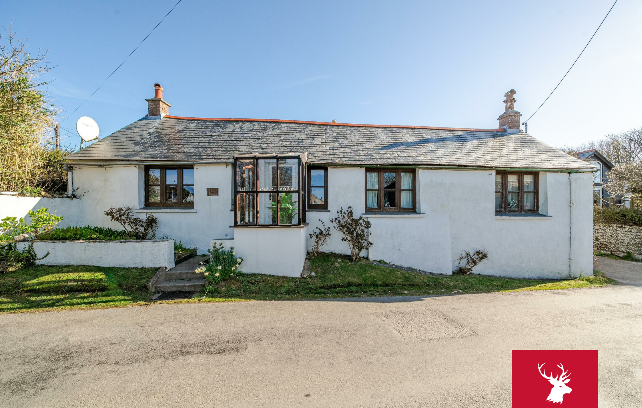
The Old Forge