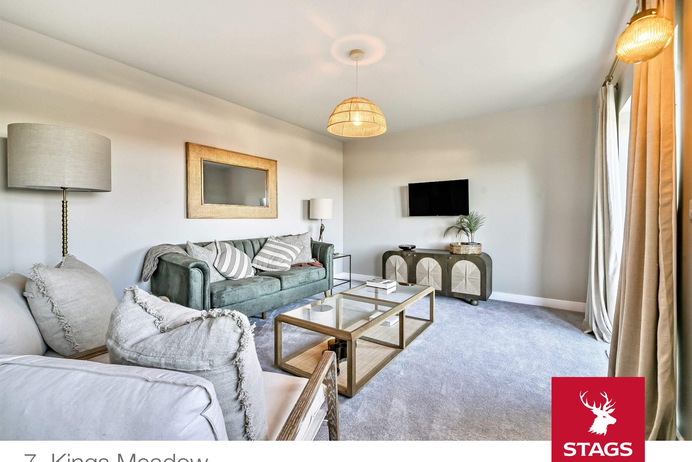
7, Kings Meadow