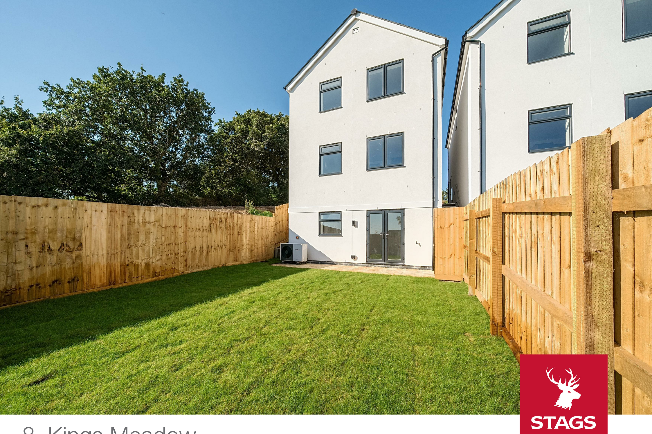
8, Kings Meadow