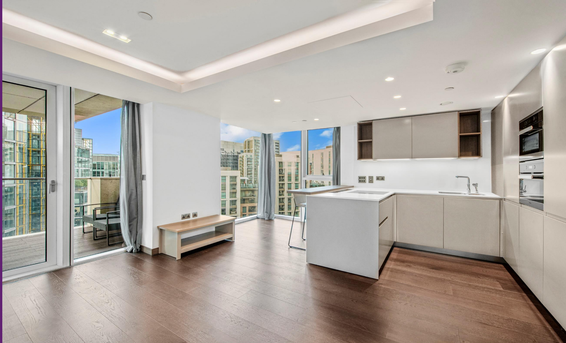
Dahlia House Paddington Gardens, W2