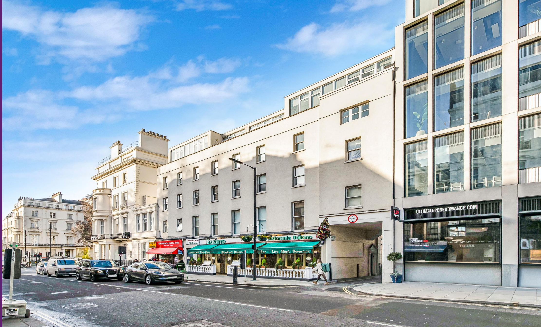
Chilworth House Chilworth Mews, W2