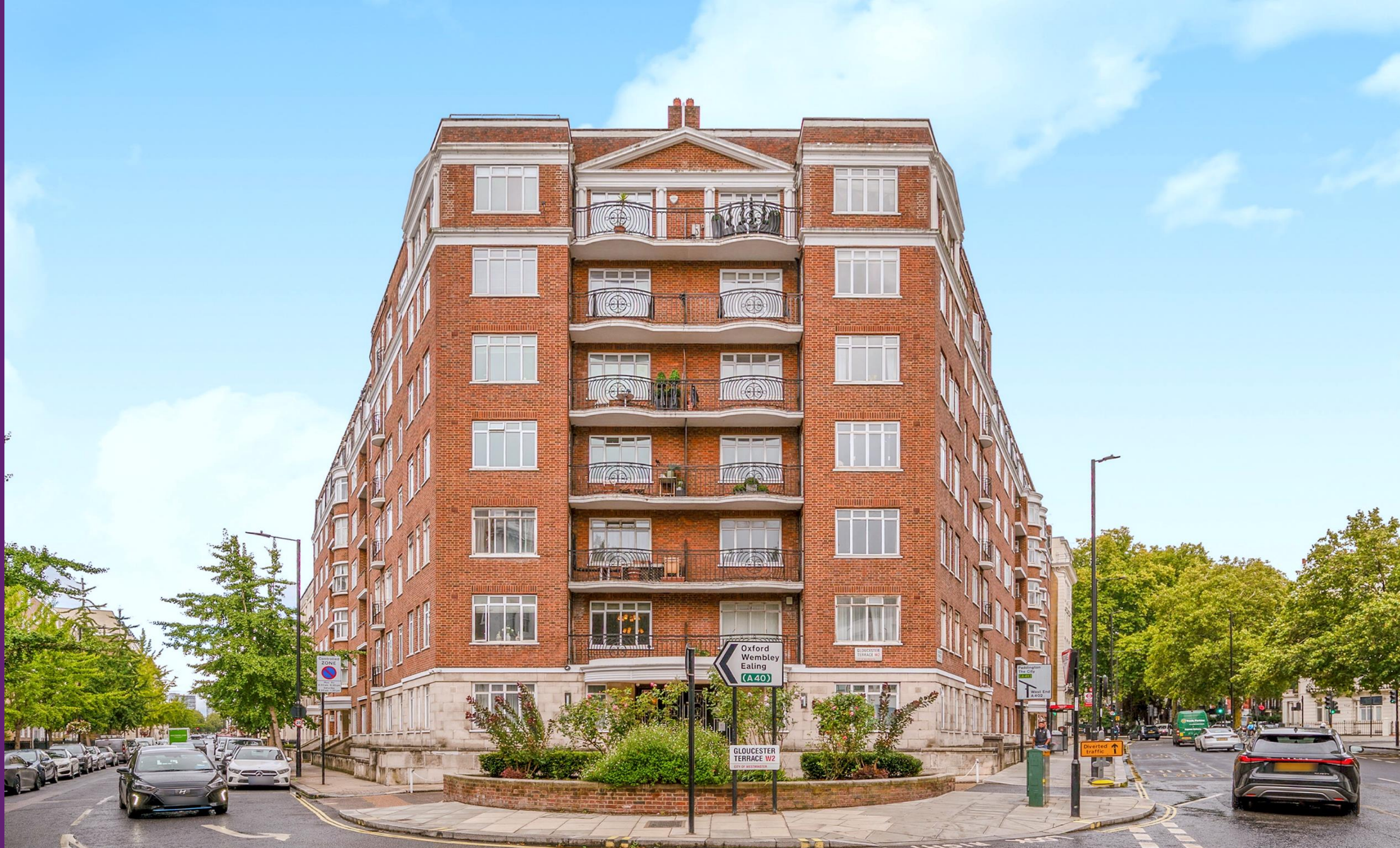
Maitland Court Lancaster Terrace, W2