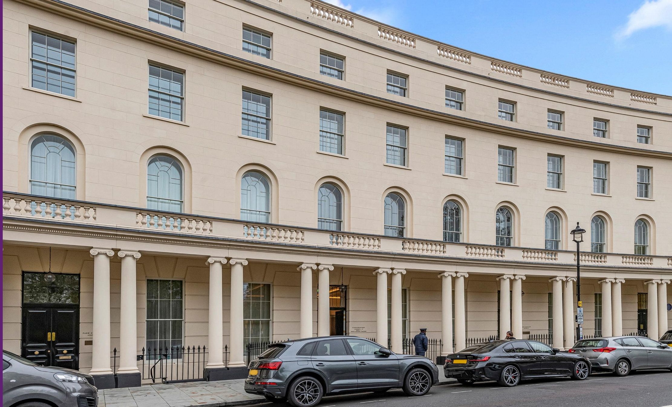
Park Crescent Hyde Park, W1B