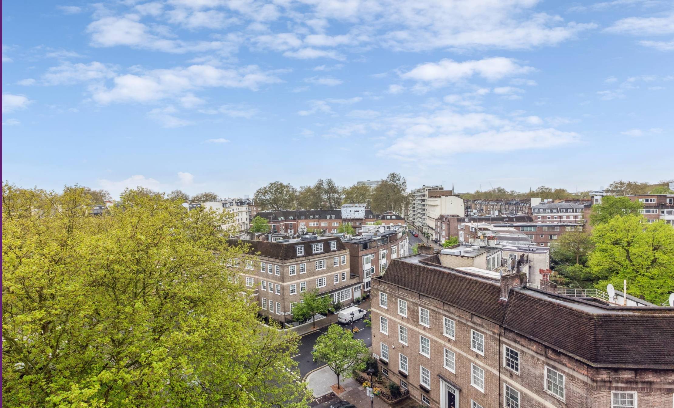
Castleacre Hyde Park Crescent, W2