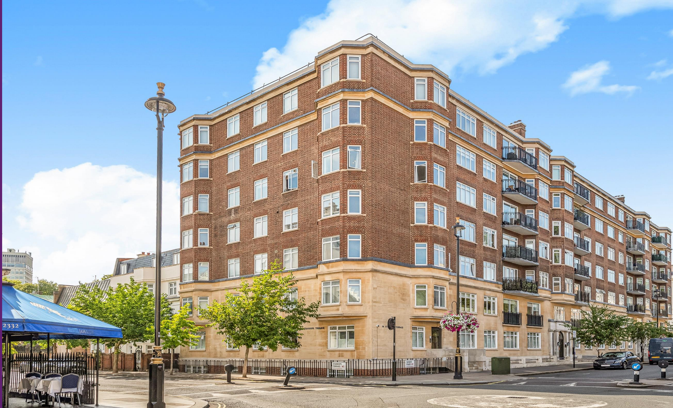
Stanhope Terrace Hyde Park, W2