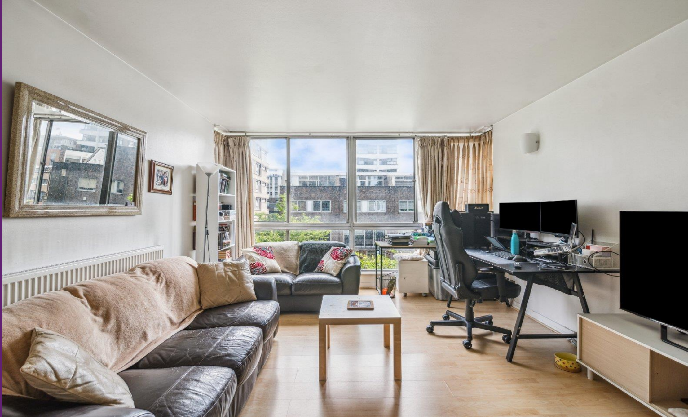
Quadrangle Tower Cambridge Square, W2