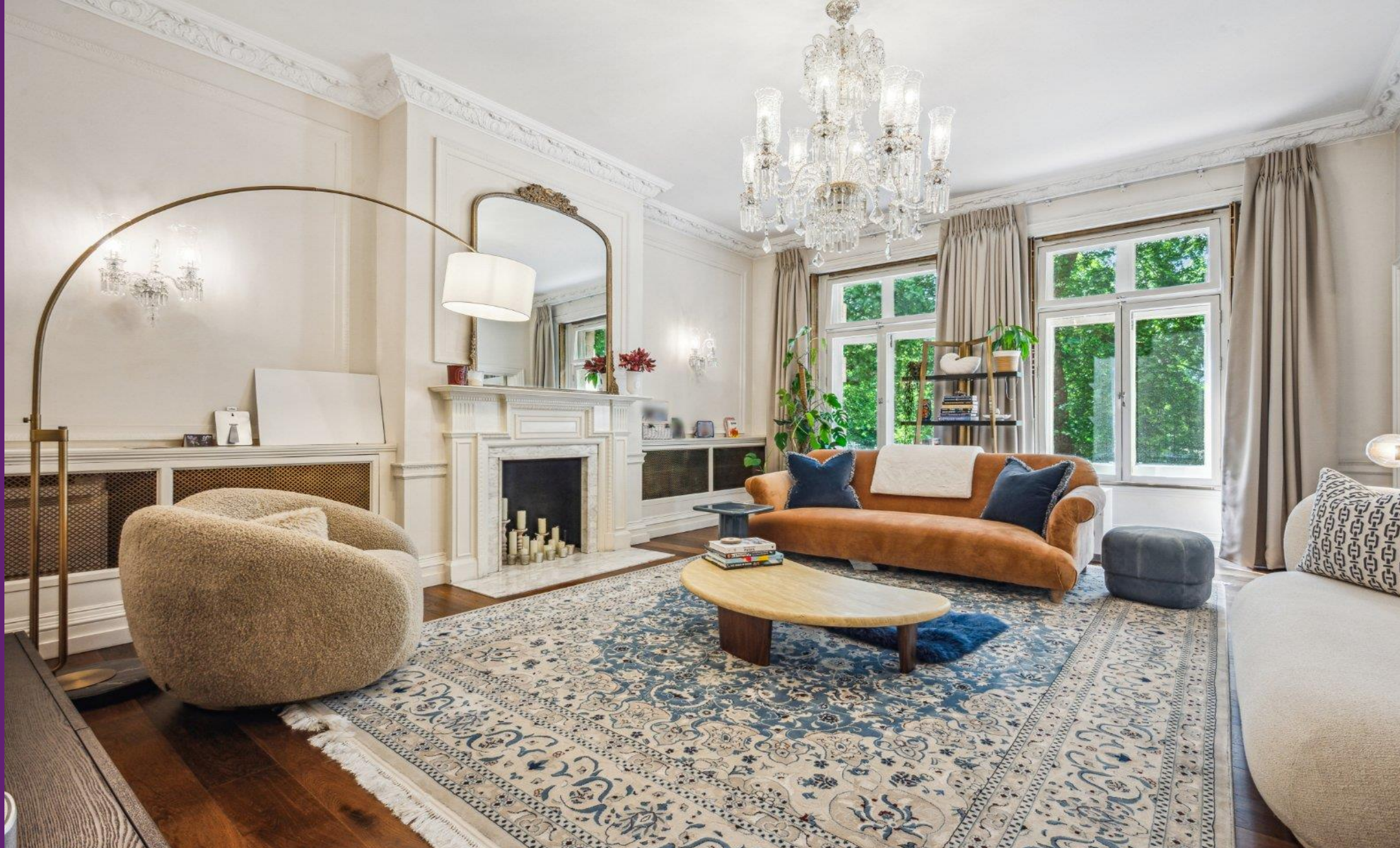
Hampshire House Hyde Park Place, W2