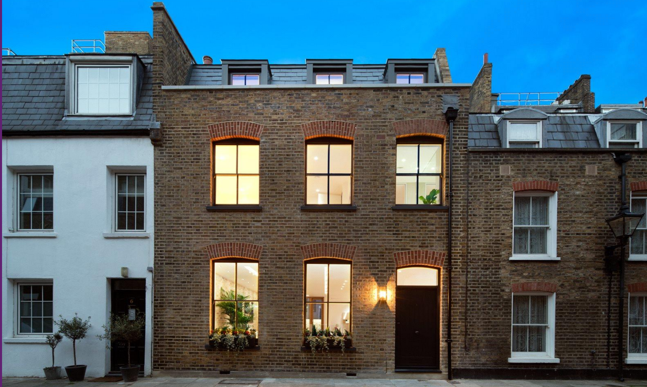
Bingham Place Marylebone, W1