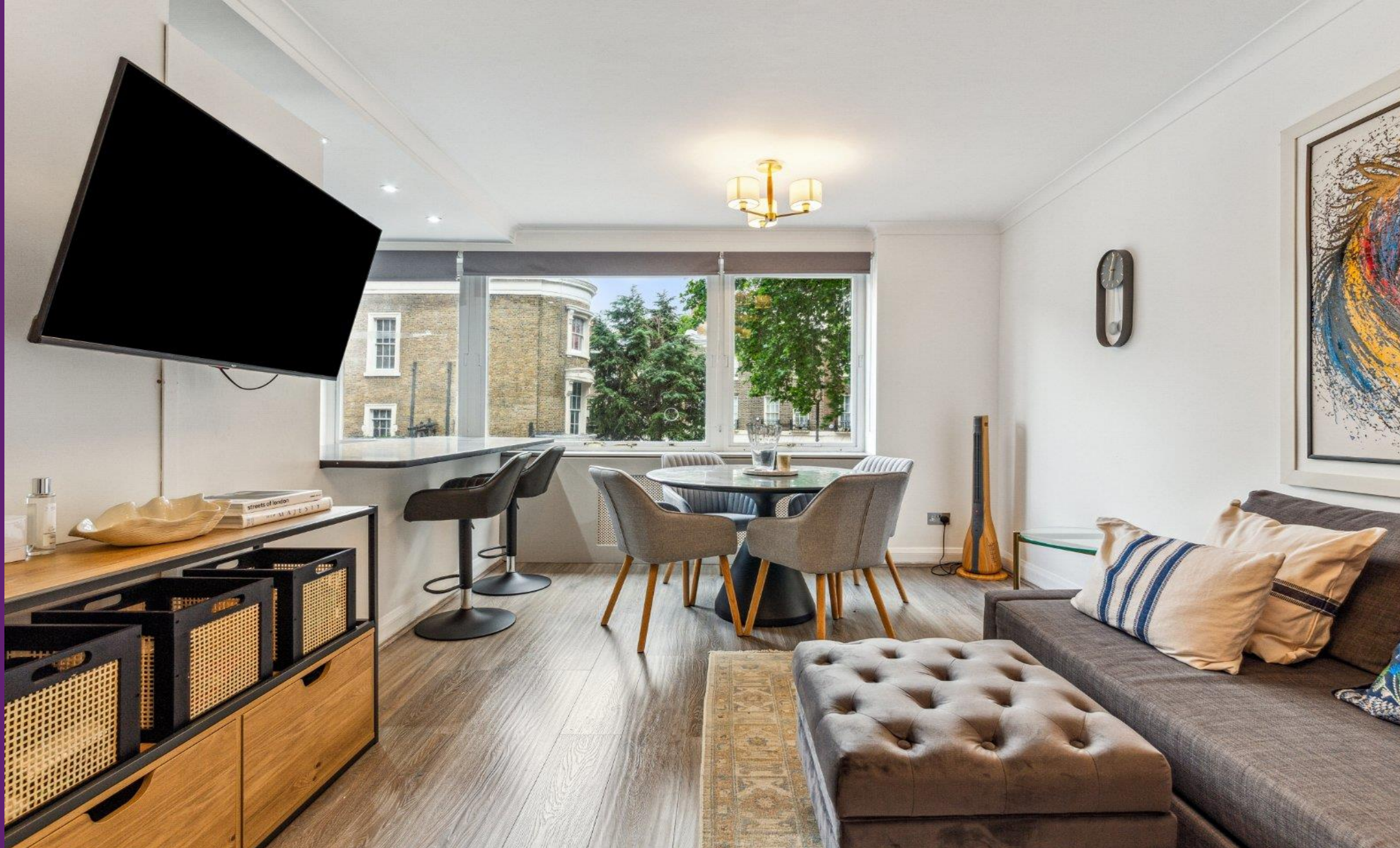
Coniston Court Kendal Street, W2