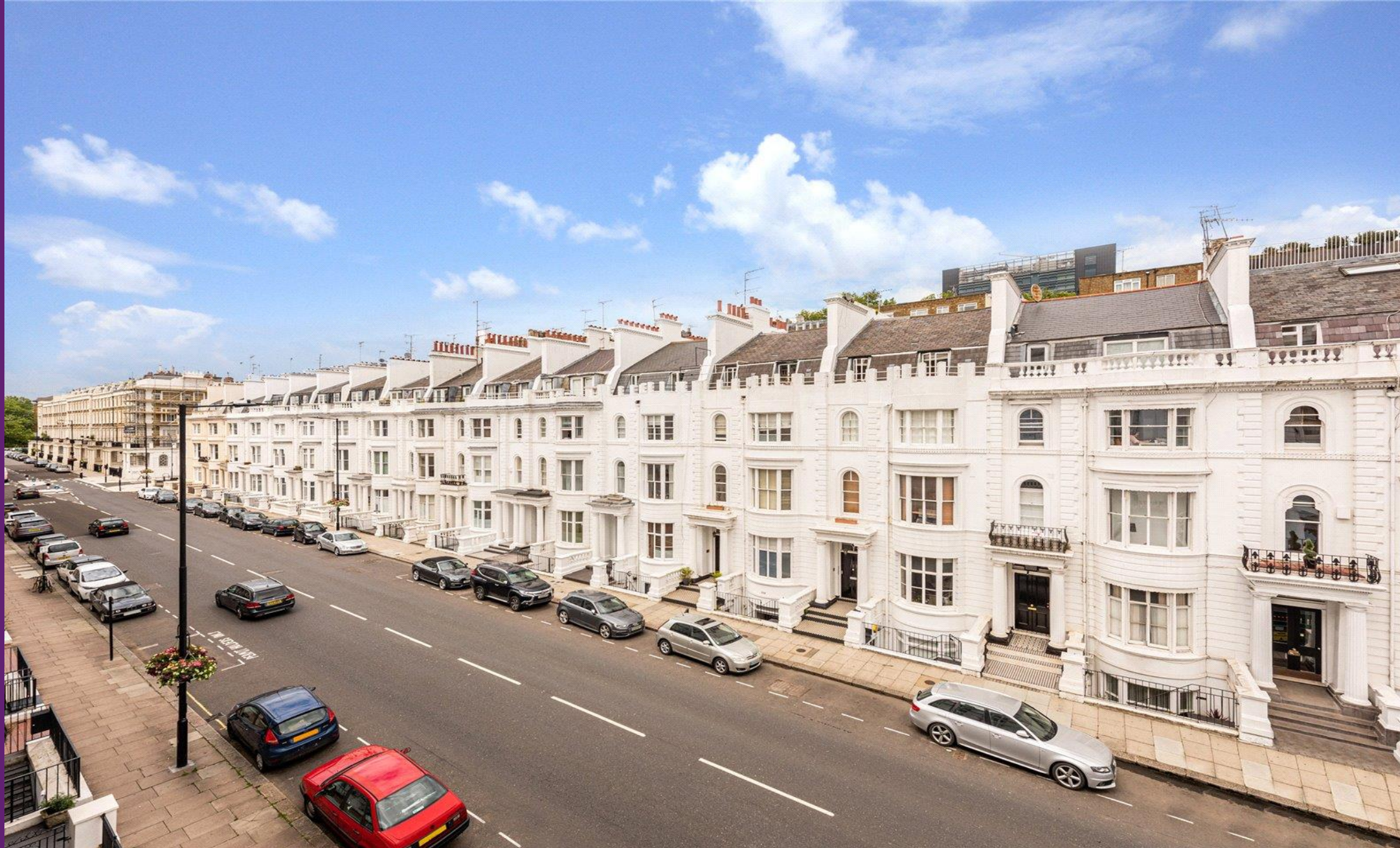
Gloucester Terrace Bayswater, W2