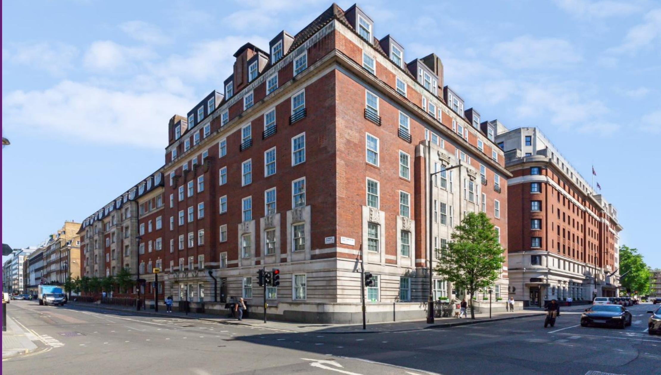
Quebec Court 21 Seymour Street, W1