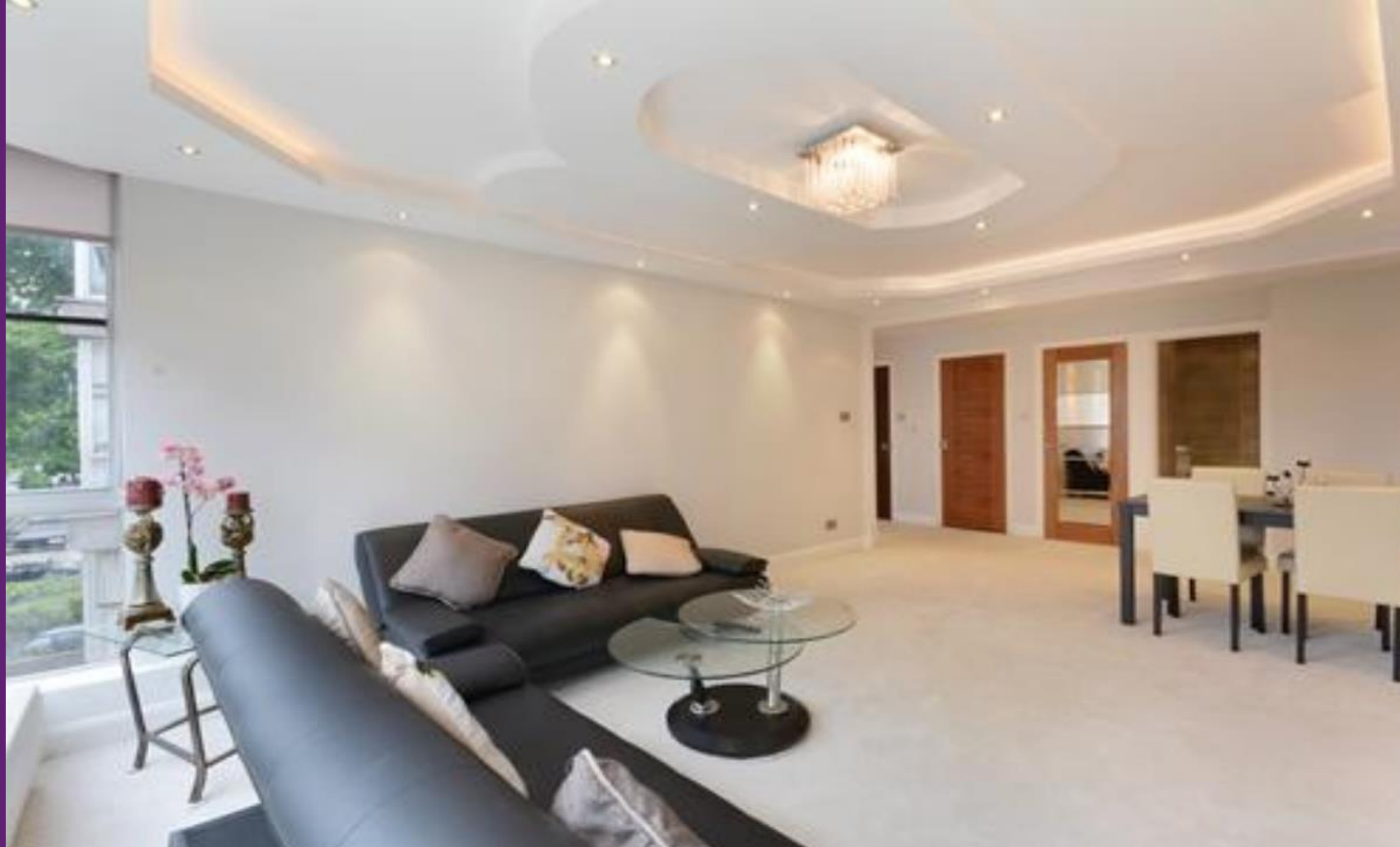
The Quadrangle Hyde Park, W2