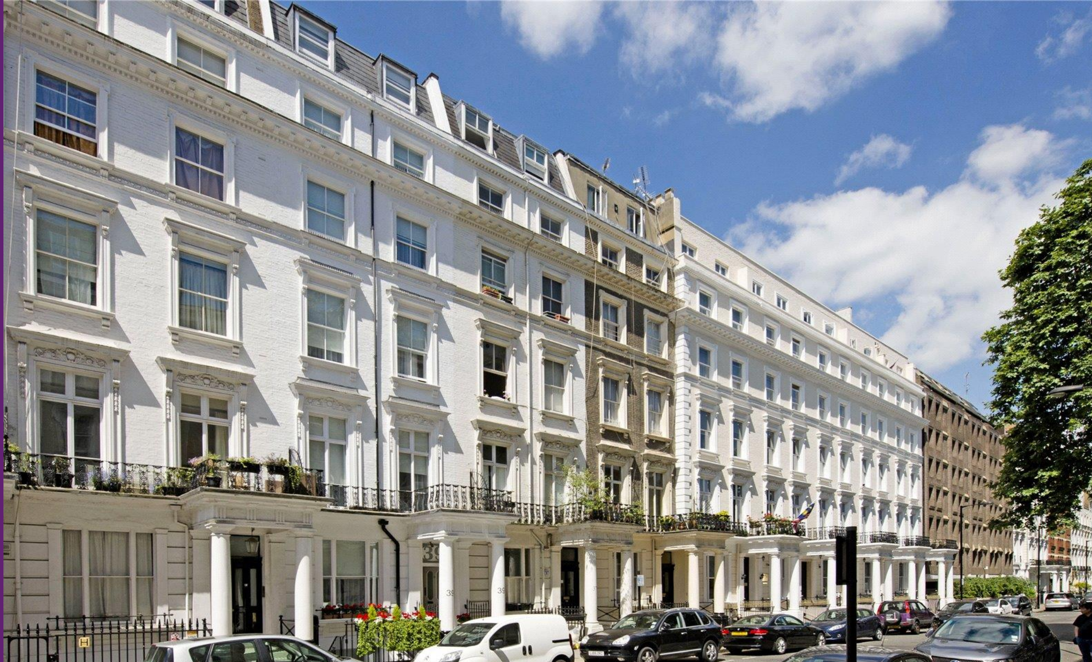
Queensborough Terrace Lancaster Gate, W2