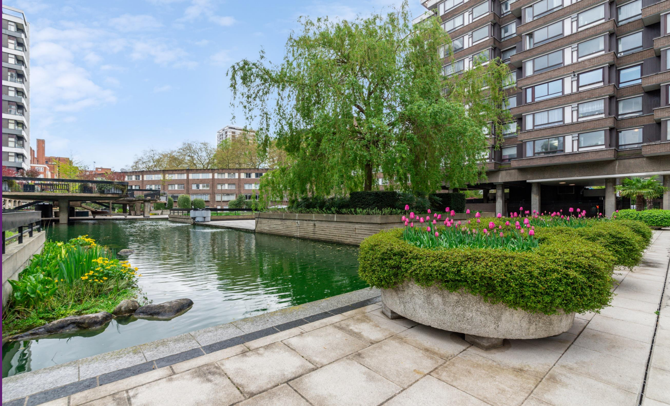
The Water Gardens Hyde Park, W2