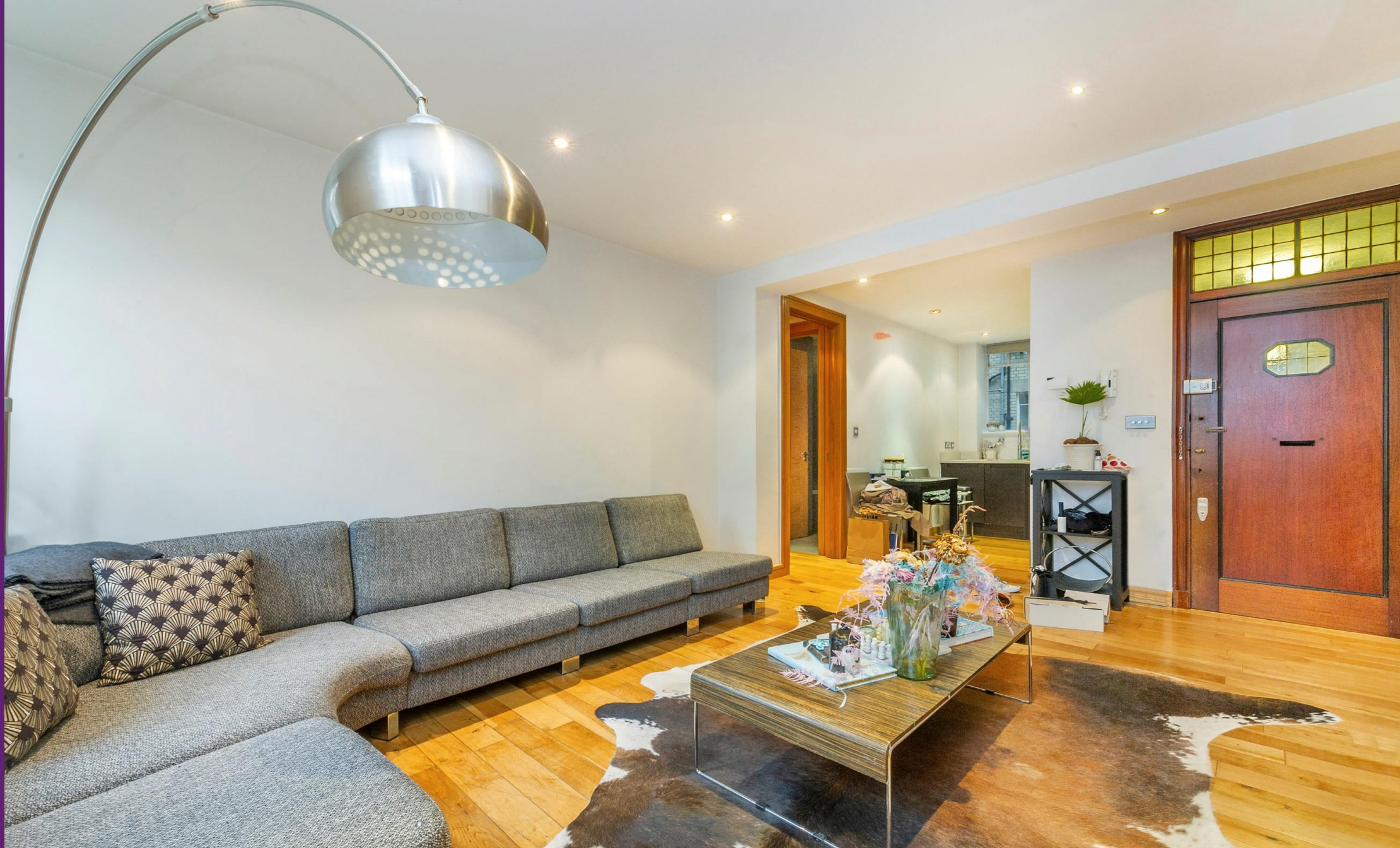
Clarewood Court Marylebone, W1