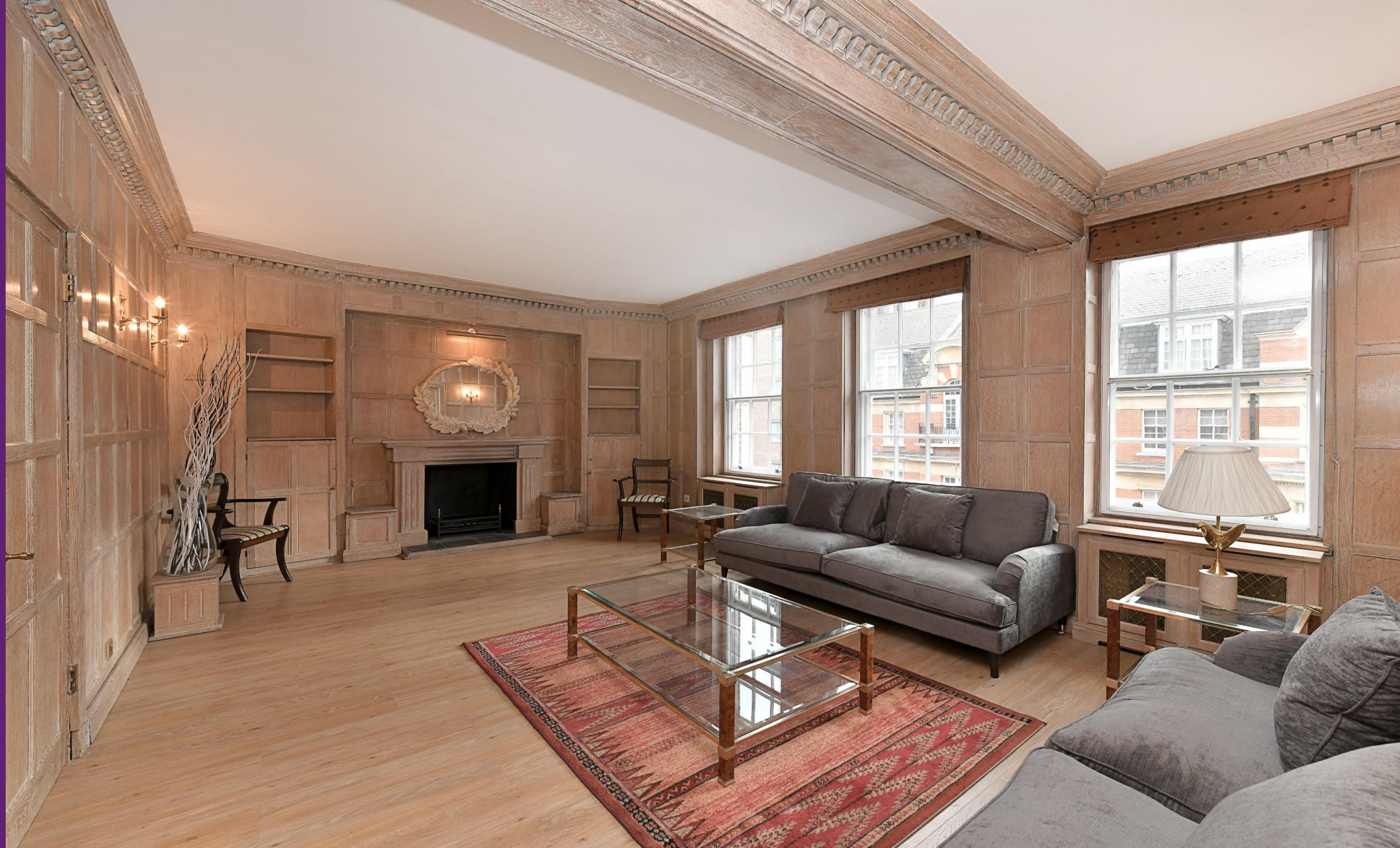
Westchester House Marble Arch, W2