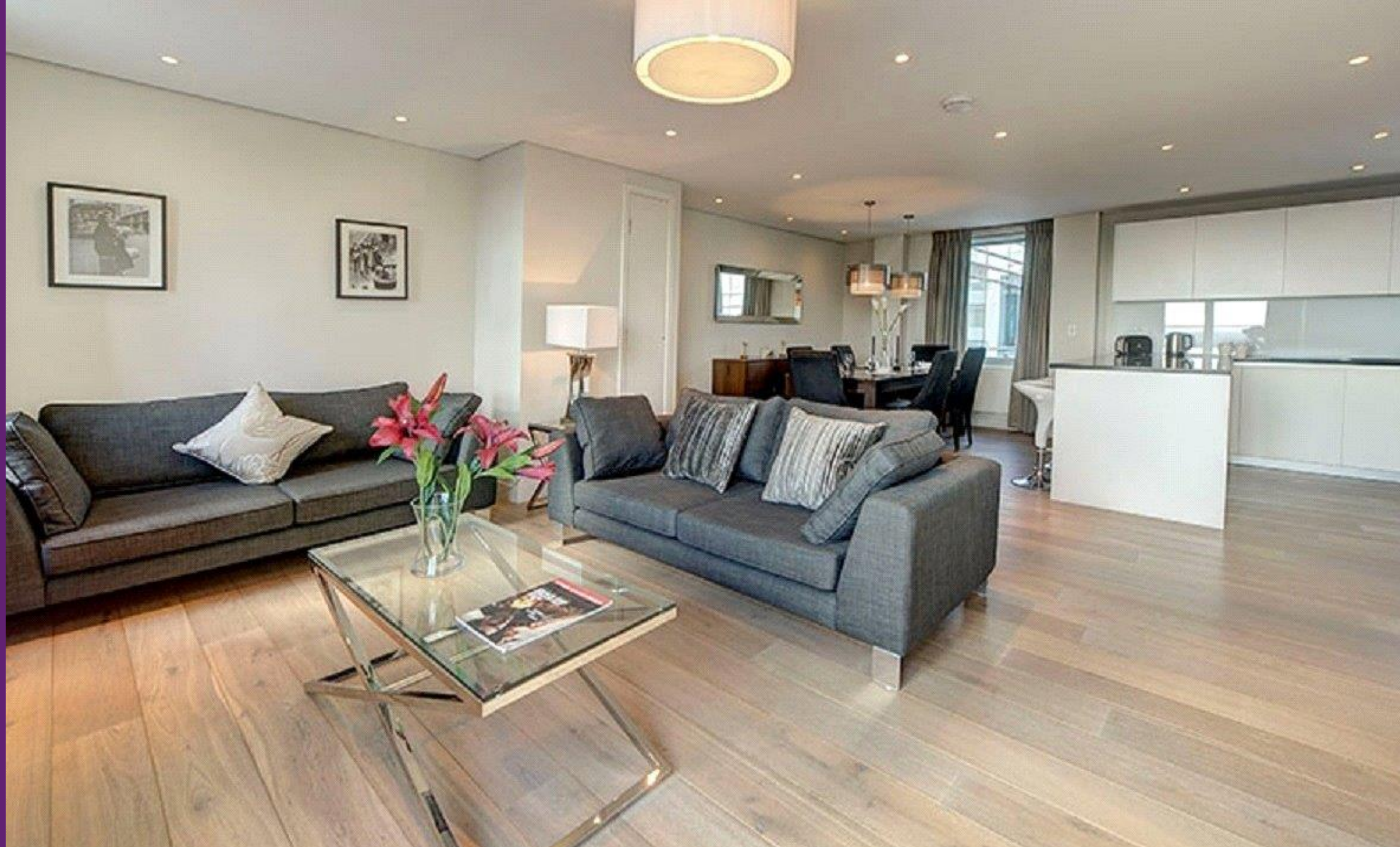
Merchant Square East London, W2