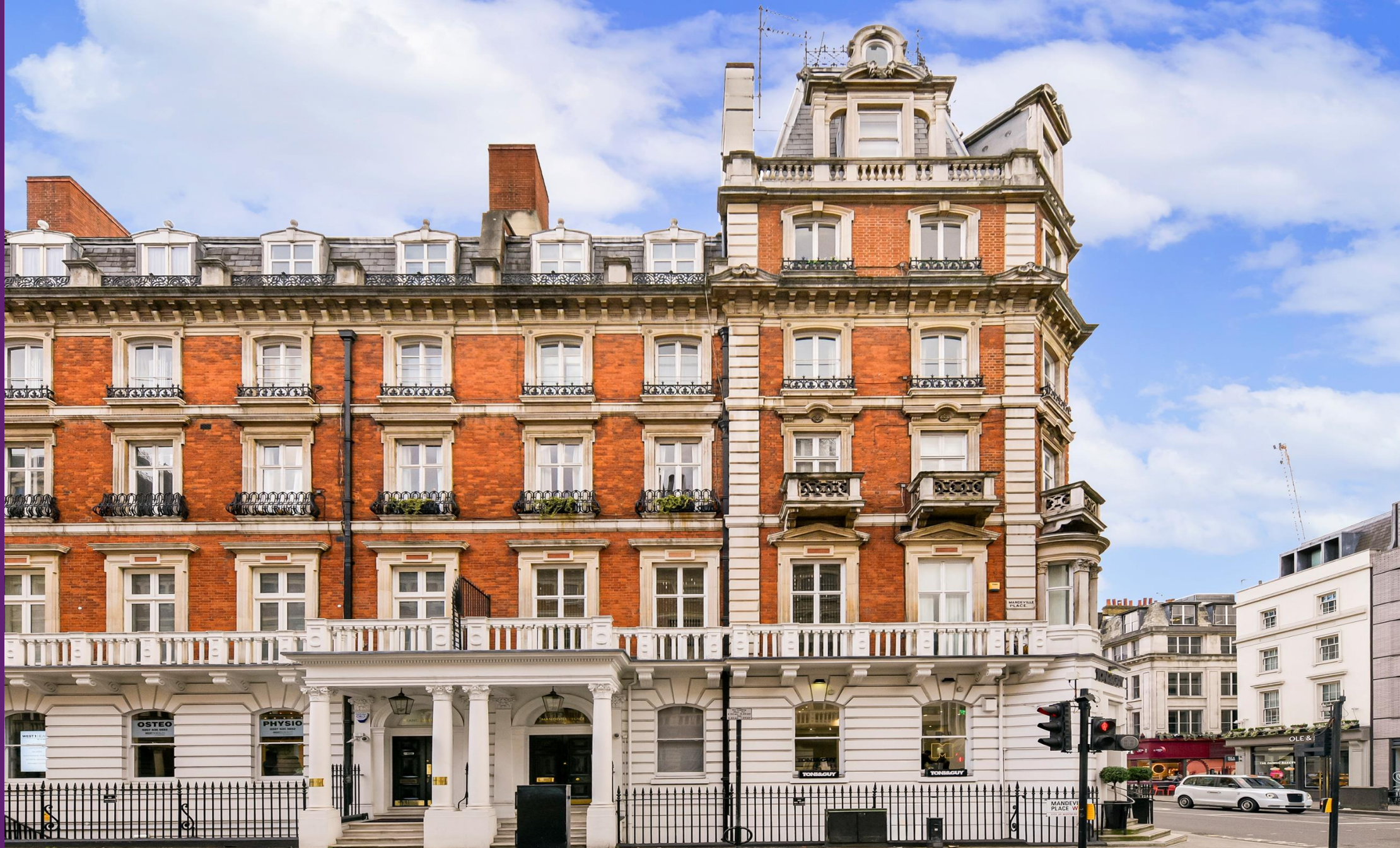
Mandeville Place Marylebone, W1