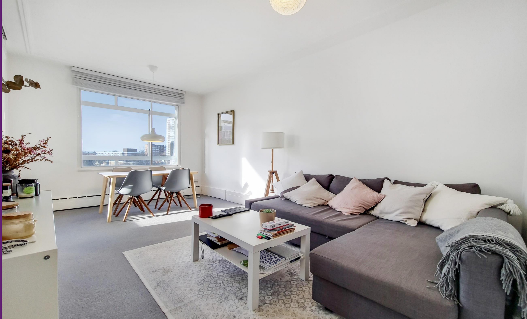
Meridien House Marble Arch, W1