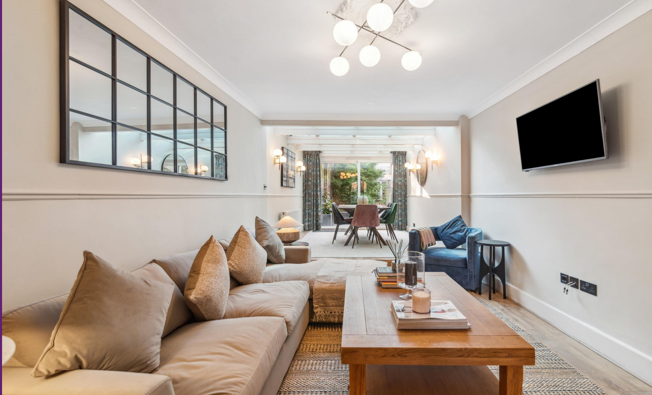
Porchester Terrace Bayswater, W2