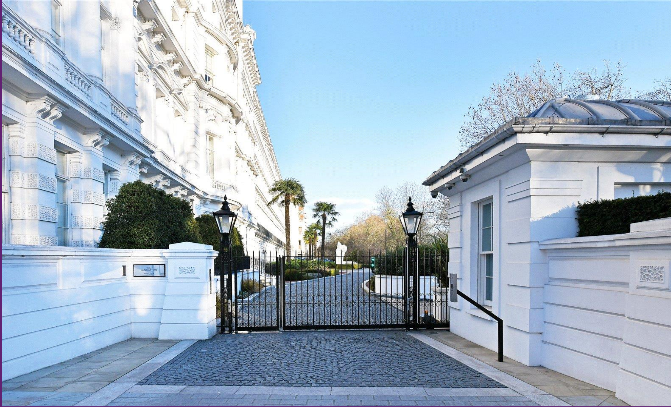
The Lancaster Lancaster Gate, W2