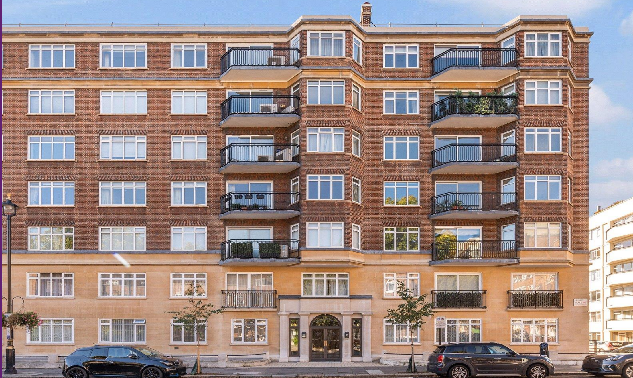
Sussex Lodge Sussex Place, W2