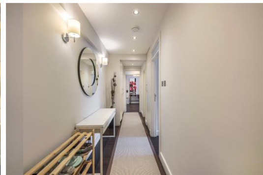
Portsea Hall Portsea Place, W2