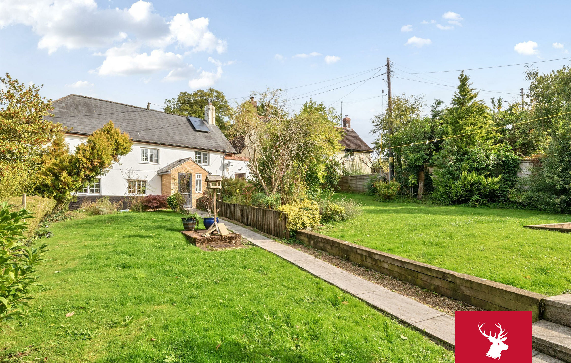
1, Lurley Cottages