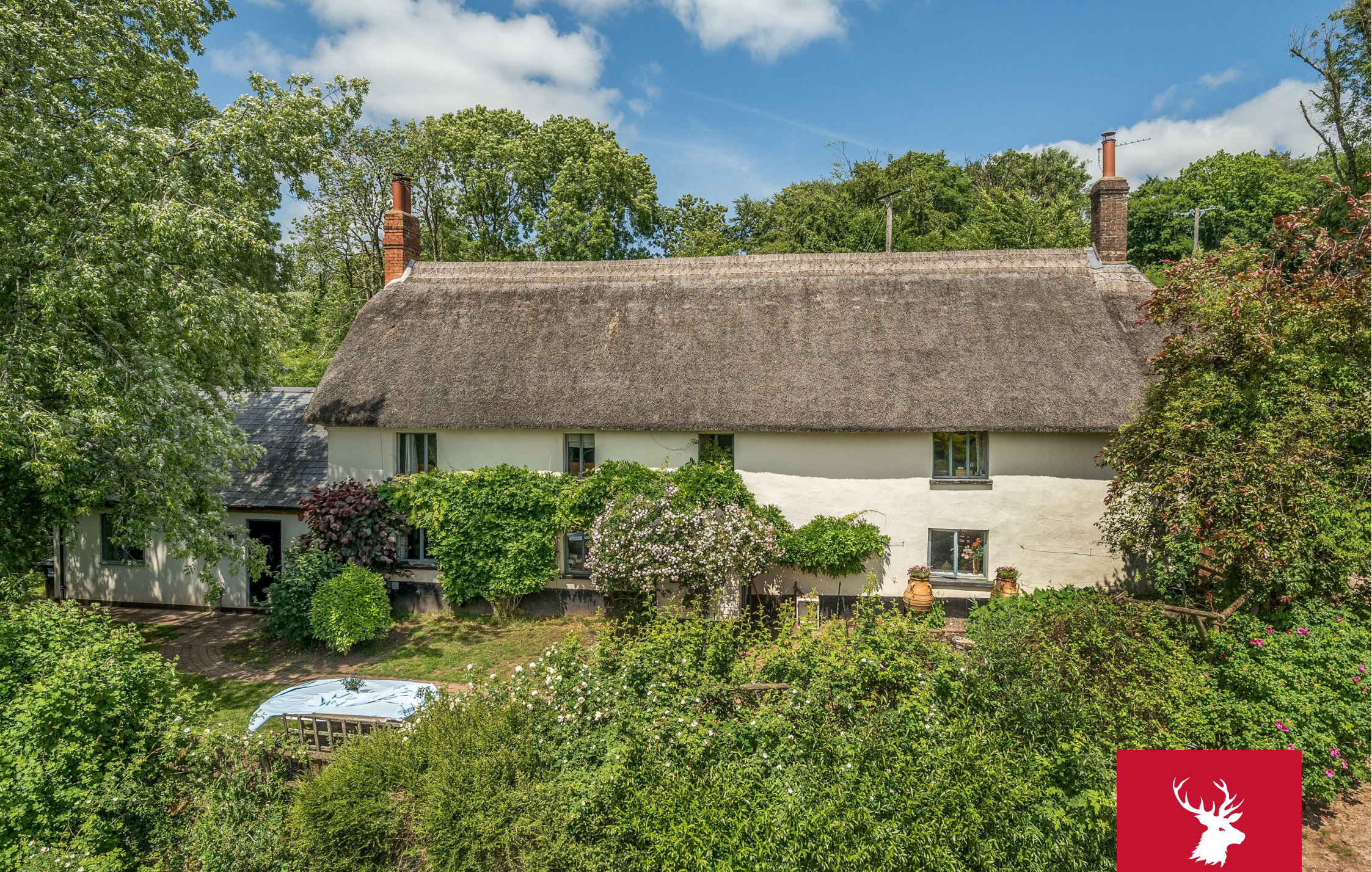
Middle North Coombe