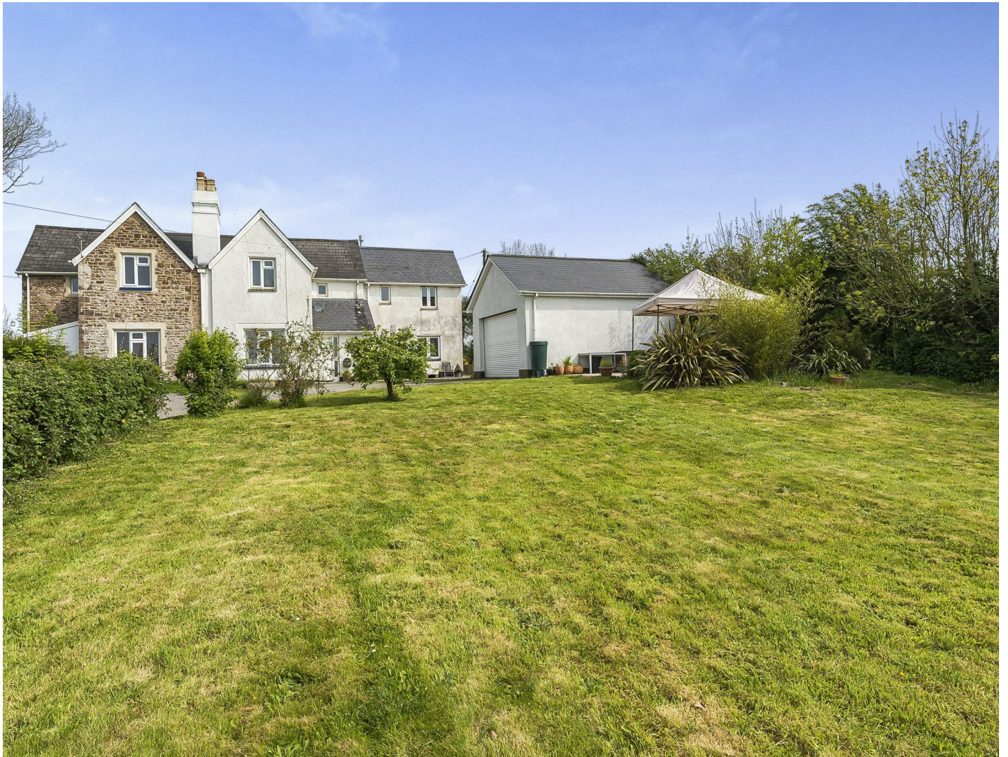
2 Westhill Cottages