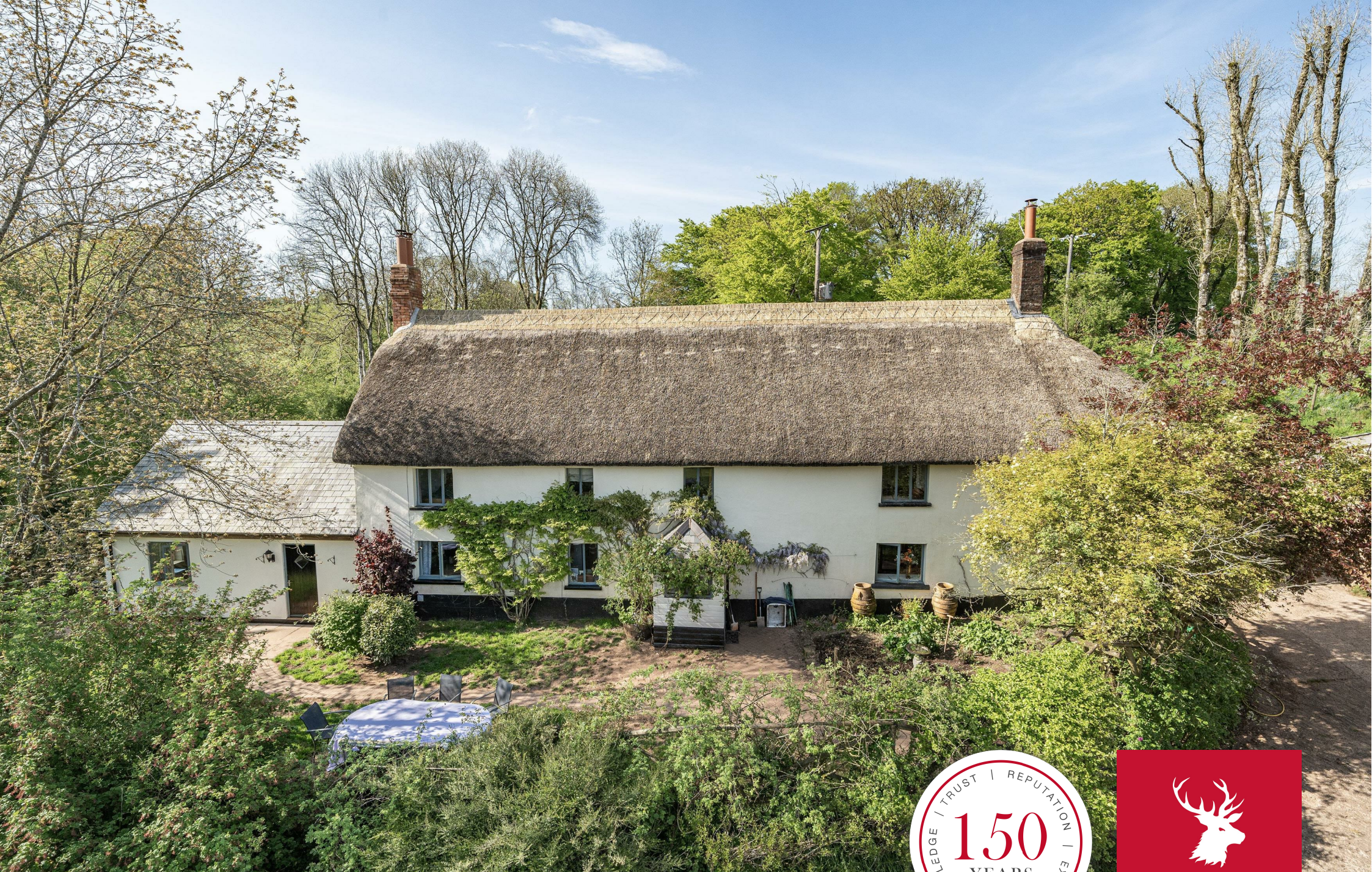
Middle North Coombe