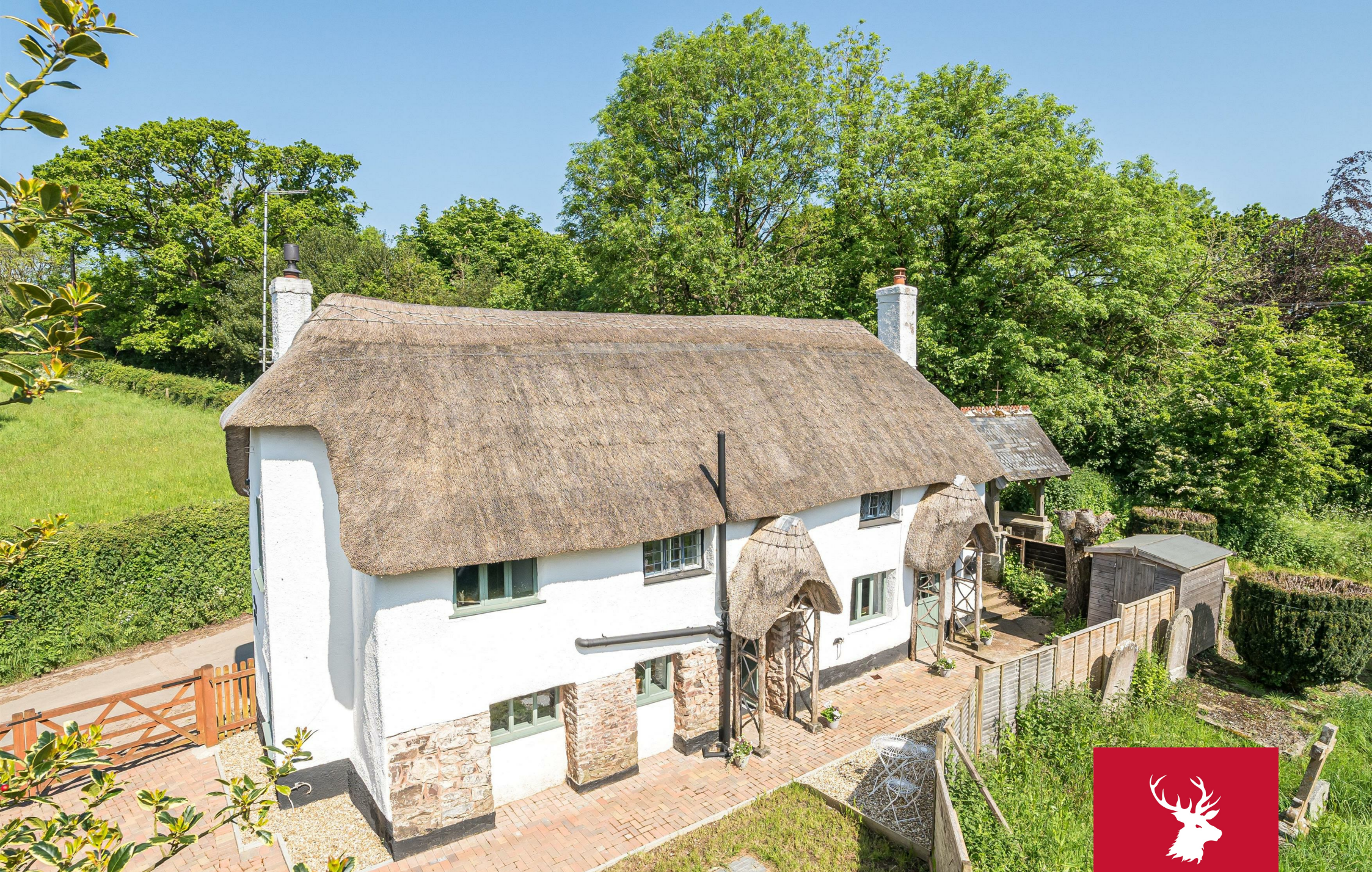
St Mary's Cottage