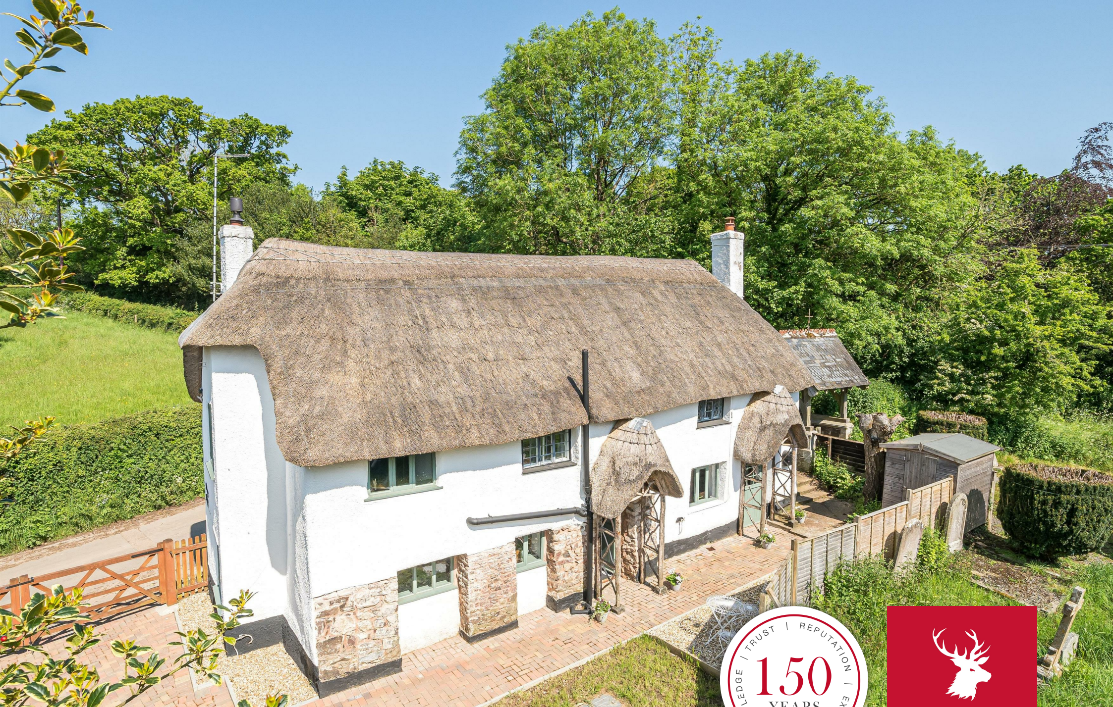
St Mary's Cottage