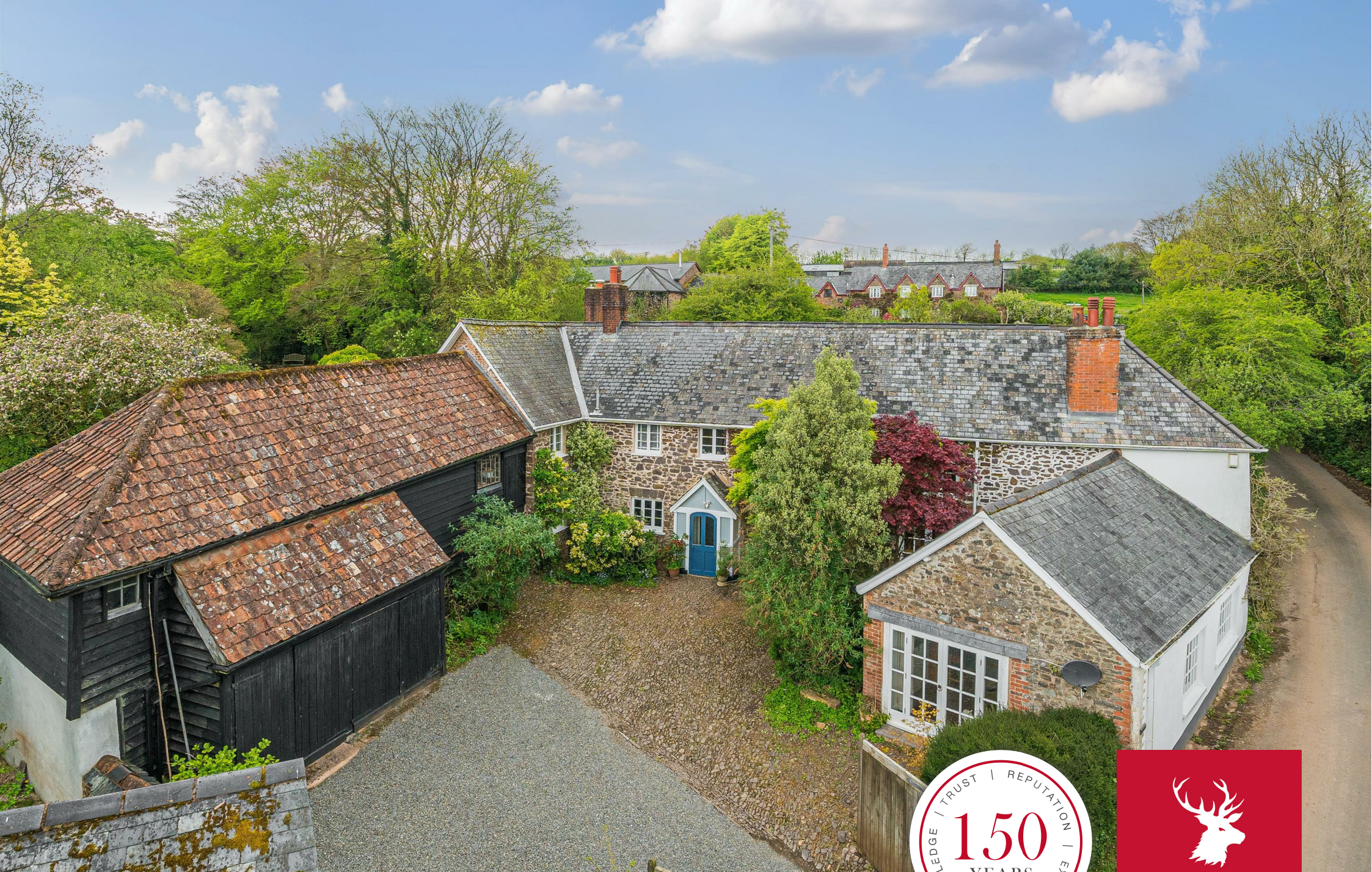
The Old Forge