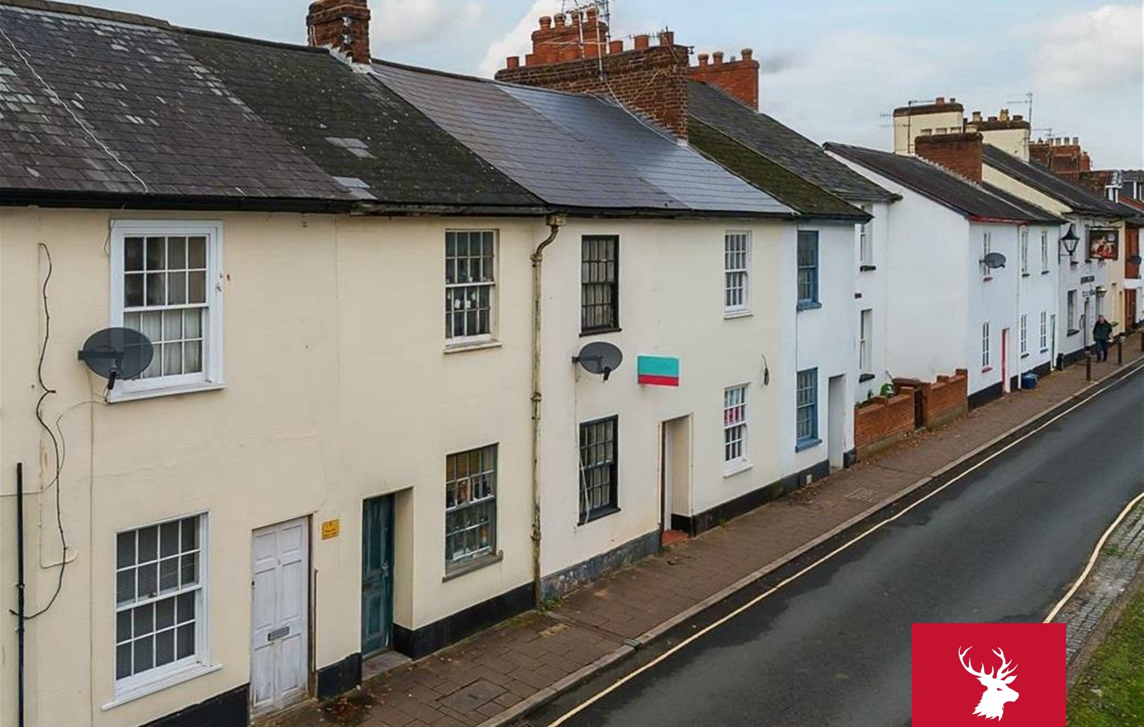
2 Castle Street