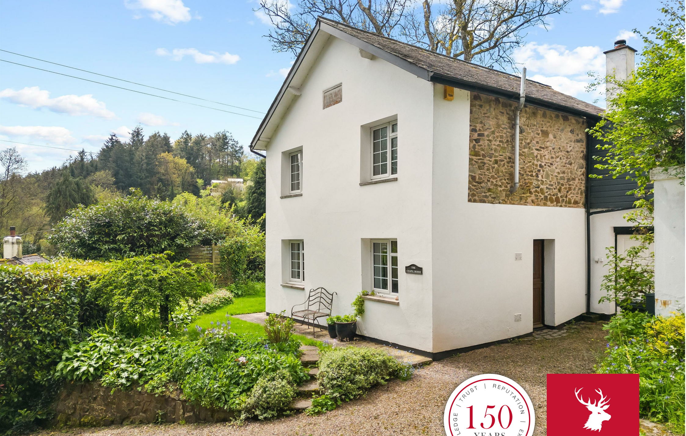
The Chapel House