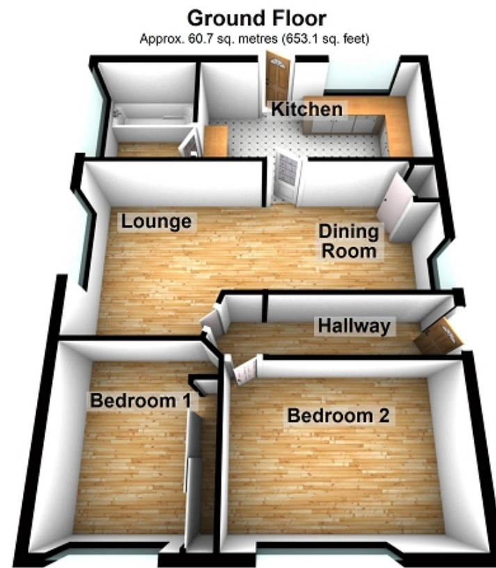
Total area: approx. 60.7 sq. metres (653.1 sq. feet)