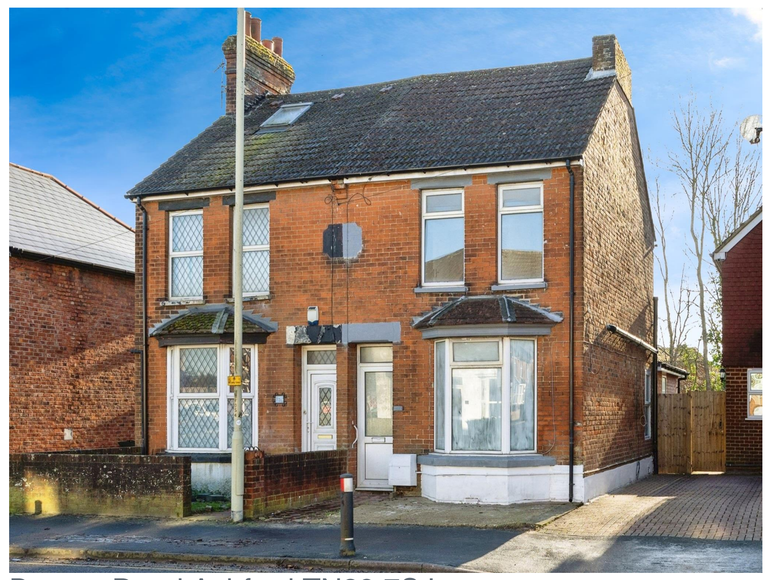
Beaver Road Ashford TN23 7SJ

3/4 Bedroom Semi Detached House - No Onward Chain - Recently Refurbished -Close to Train Station & Town Centre - Two Shower Rooms & Downstairs WC -Potential to Rent out as HMO