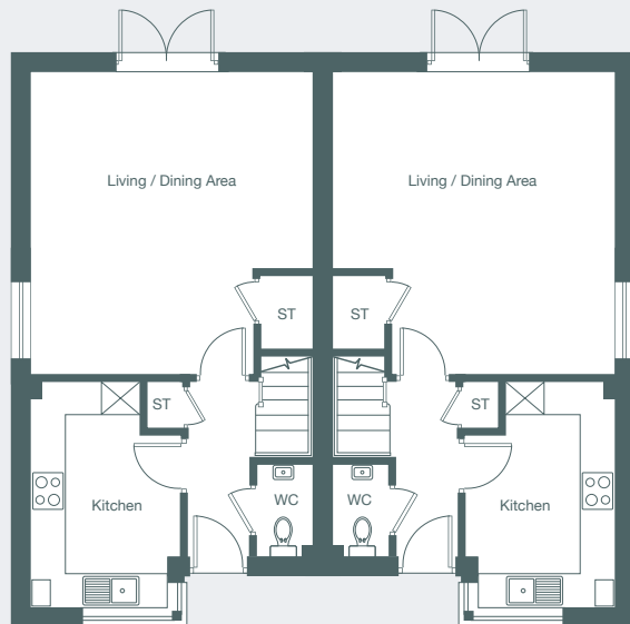
Ground Floor Plan Left