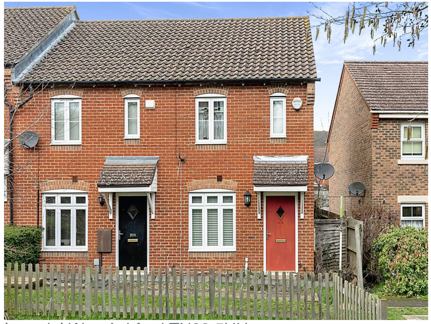
Imperial Way Ashford TN23 5HU

Two Bedroom End of Terrace House -Front and Rear Gardens - Allocated Parking - Downstairs W/C - Popular Location of Singleton - No onward Chain