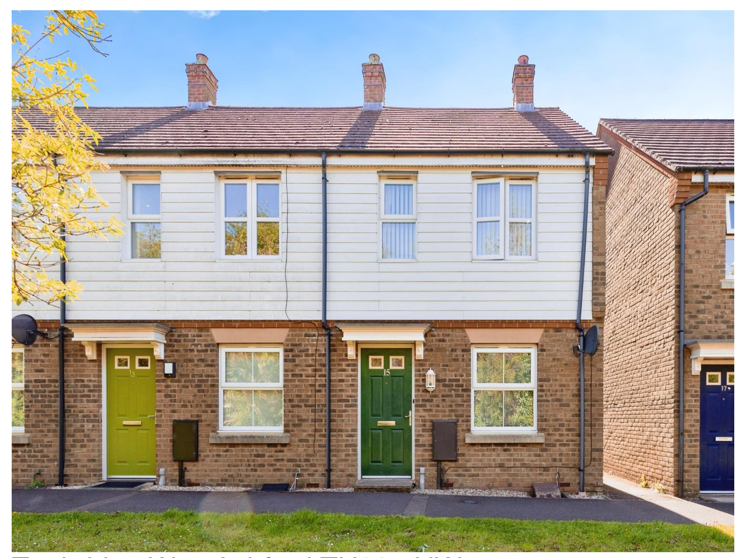
Tunbridge Way Ashford TN23 5HW

Two Bedroom End of Terrace House - 25% Ownership, Rent Payable on Remaining 75% - Car Port - Downstairs WC - Kitchen/Diner - Popular Location of Singleton