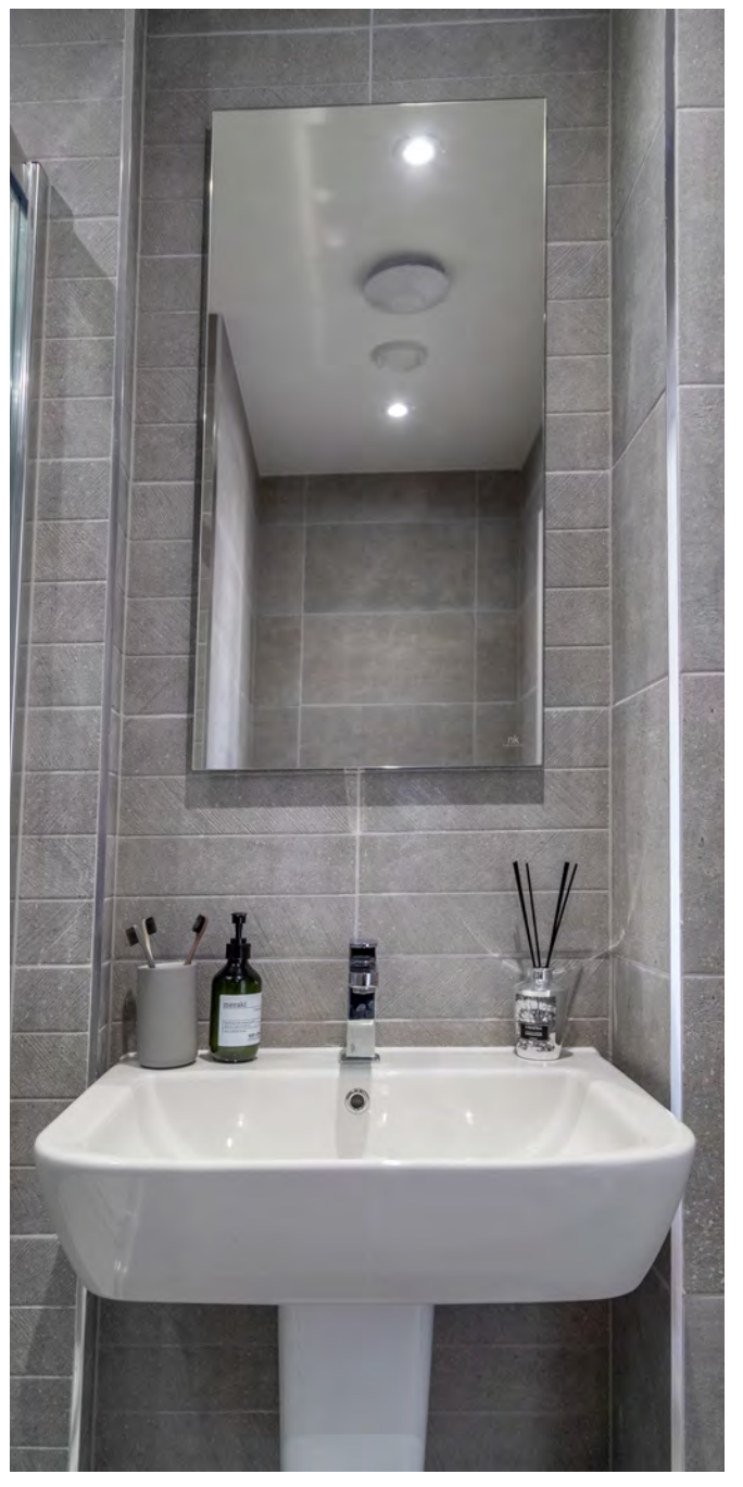
PREVIOUS PANACEA DEVELOPMENTS