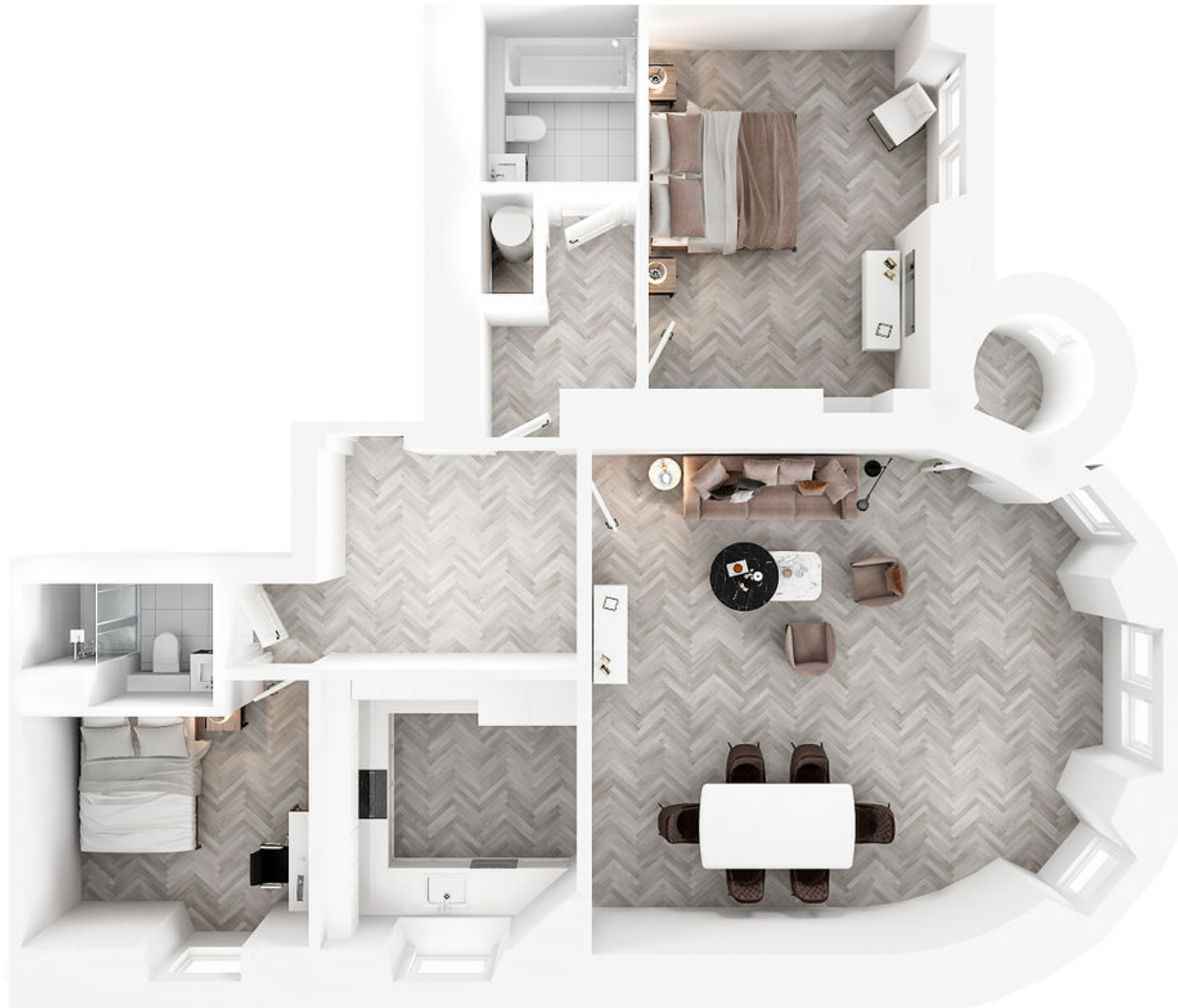
CAIRNDHU FIRST FLOOR | APARTMENT 2 'THE LEIPER' 2 BEDROOM APARTMENT | 105M2 | 1130FT2