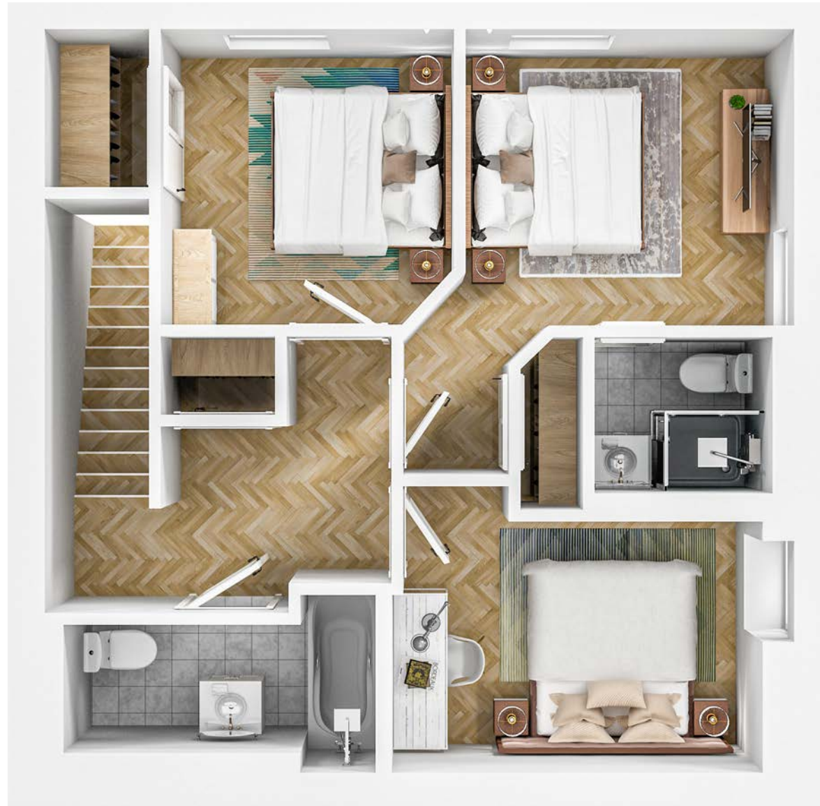
SEMI DETACHED 1 3 BEDROOM HOUSE | 98M2 | 1057FT2

NOTE: Images are purely indicative of style and specification. Similarly descriptions, floor plans, kitchen layouts and sizes/dimensions are approximate and do not form any part of any contract.