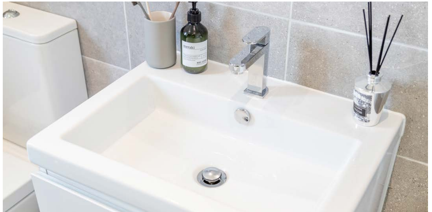
PREVIOUS PANACEA DEVELOPMENTS