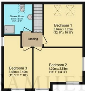
First Floor Floor area 49.0 m 2 (527 sq.ft.)