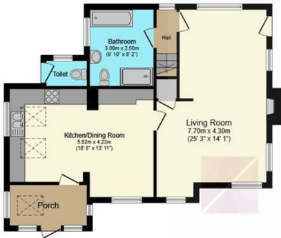
Ground Floor Floor area 67.3 m 2 (725 sq.ft.)