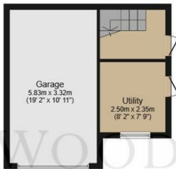
Annexe Ground Floor Floor area 31.5 m 2 (339 sq.ft.)