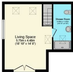
Annexe First Floor Floor area 30.6 m 2 (329 sq.ft.)