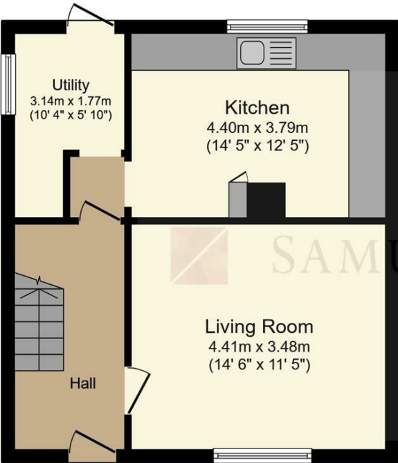
Ground Floor Floor area 41.0 sq.m. (442 sq.ft.)